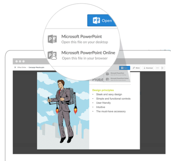
Edit Box content with Office Online or on the desktop