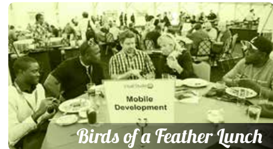
Birds of a Feather Lunch