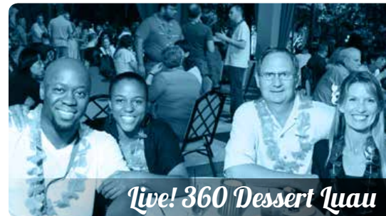
Live! 360 Dessert Luau

Come celebrate the South Pacific with delectable desserts, drinks, and fabulous entertainment courtesy of Live! 360 and Amazon Web Services! Mingle with fellow attendees and speakers while enjoying the warm Florida winter weather. Settle down under the stars to enjoy a delicious dessert buffet, complete with cocktails, and an authentic Polynesian performance including dancers and fire throwers.