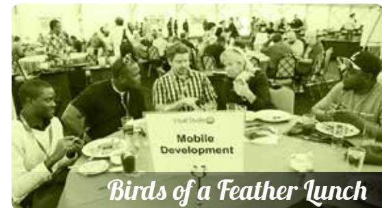
Birds of a Feather Lunch