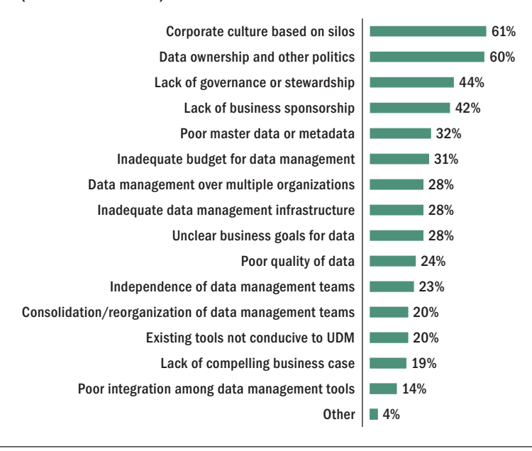
Figure 1. Based on 857 responses from 179 respondents (4.8 average responses per respondent).

In your organization, what are the top potential barriers to coordinating multiple data management practices? (Select six or fewer.)