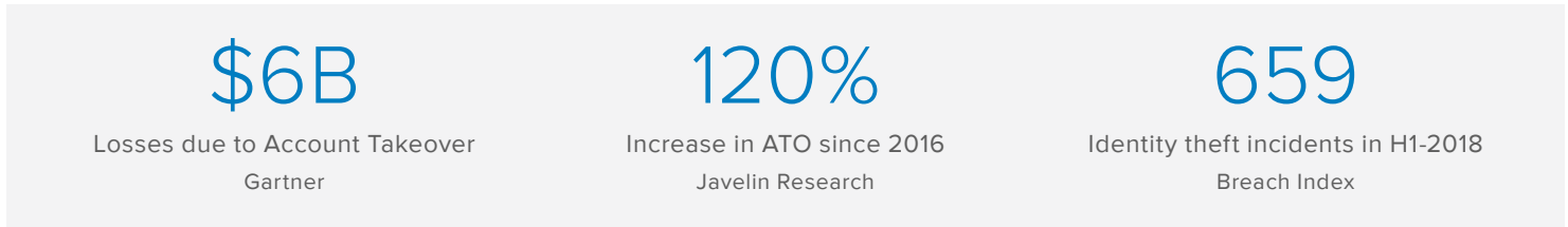
Account takeover at a glance

Account Takeover (ATO)—An increasingly common consumer attack method wherein a bad actor gains illegal access to a user’s account, and can exploit that access for financial or informational gain. Every digital business featuring a login page is at risk to this method.