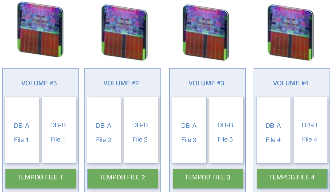
Figure 3: Distribution of Content Database Files Across Volumes

In Figure 3, a total of four files were created for each database. For example, DB-A is broken into four files distributed across four volumes, as is DB-B. It is also important to do the same for the SQL tempdb file, which is a critical file for SharePoint performance. As illustrated in Figure 3, the rough calculation to determine how many files to create is directly related to the number of physical processors in use on the SQL Server used by SharePoint. In this case, there are four physical processors, which is why the total number of files created is four. You may run into guidance that dictates that the number of files to create should equal the number of processor cores, but this guidance originated with SQL 2000 testing and is not as accurate for today’s modern multi-core processors. While there is no perfect equation for this and creating too many files does not necessarily lead to performance issues, the best practice in this case is to distribute by number of physical processors, not the number of cores.