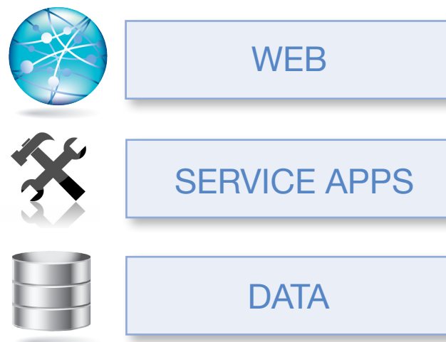
Figure 1: Three Tiers of SharePoint Architecture

One reason why SharePoint can grow very large very quickly is that every version of every document stored in SharePoint is stored in full within the content database as a BLOB. For example, if 100 versions of a 5MB document are stored within SharePoint, the total amount of space consumed by that single document is 500MB alone. Since document versioning is a major selling point with SharePoint document management, this often leads to a rapidly growing SharePoint environment. It is now common for SharePoint storage tier sizes to exceed a terabyte. In fact, this has become the norm for even mid-sized or smaller organizations. Because of the aforementioned performance issues, as well as the need to house the data, organizations need to pay close