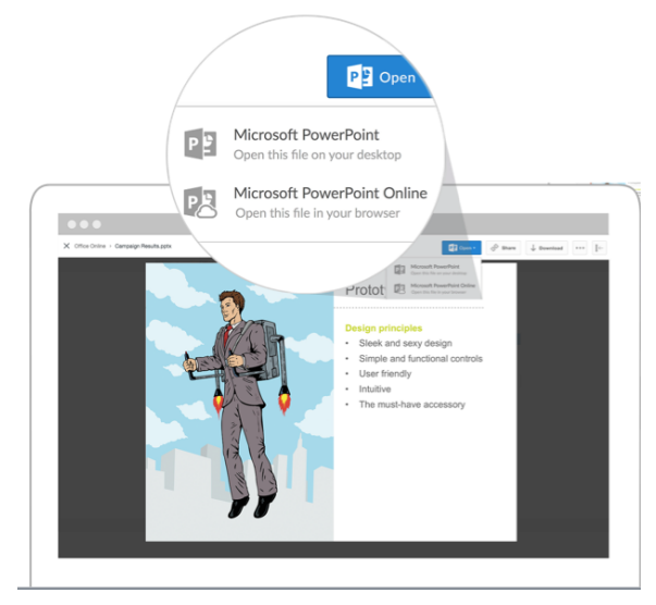
Edit Box content with Office Online or on the desktop